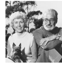
THE THEODOR AND AUDREY GEISEL FUND