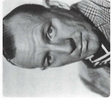
NOËL COWARD Playwright

Noël Coward was an English playwright, composer, actor, producer and director. His plays include The Vortex (1924), Hay Fever (1925), Private Lives