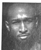
DONALD WEBBER, JR.